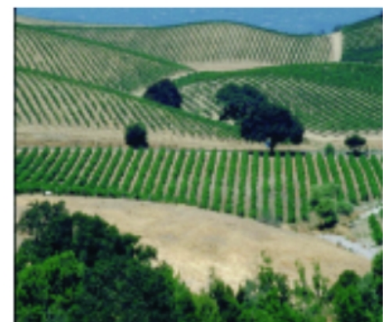
Matt 13:8 Matt 13:23