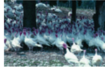
Matt 13:4 Matt 13:19