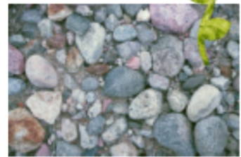
Matt 13:5-6 Matt 13:20-21